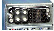
Rear View showing Elcon Connector